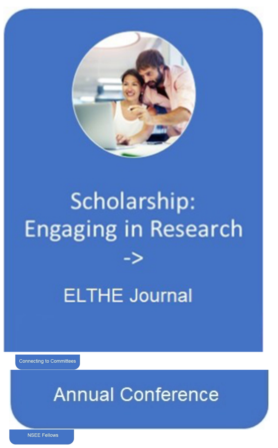
Join a Global Community of Experiential Educators

SEE is proud to announce a new membership feature - the Experiential Education Campus Leadership Network. Professionals who lead or coordinate experiential education for their college/university campus are often "alone" in their work. They are without obvious peers on their campuses and would benefit from a network of peers who are doing comparable work and facing similar challenges. SEE aims to fill that gap by creating the Experiential Education Campus Leadership Network. This is an optional special interest group that can be added to